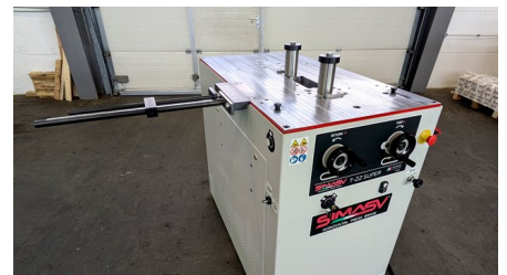
Symbole Photo, shows Model T 22 Super