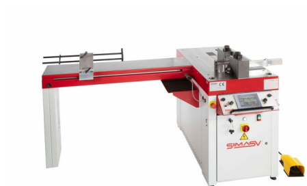
Optional CNC version