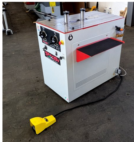
Symbole Photo, shows Model T 22 Super