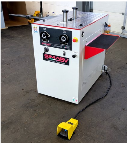
Symbole Photo, shows Model T 22 Super