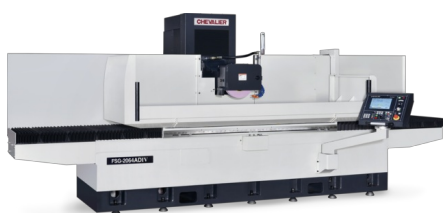
Symbolfoto (zeigt Modell FSG2064ADIV)