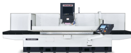
Symbolfoto (zeigt Modell FSG2064ADIV)