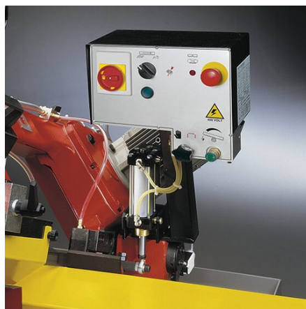
SA (regulierbare Absenkung)