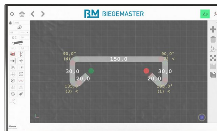
optionale BMS MULTI-Touch