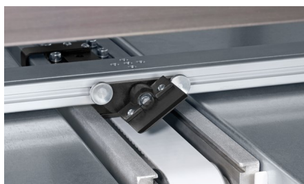
Optional back gauge