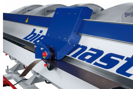
Optional electrical cutter