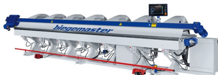
symbol photo shows model with options