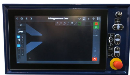
Optional BMS MULTI-Touch