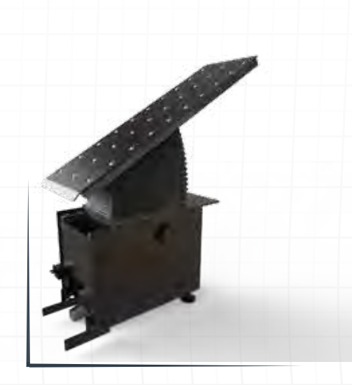
■ Robotic System of Applications