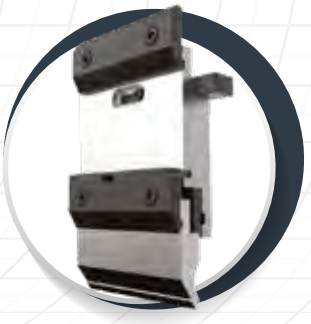
Quick Release Clamping