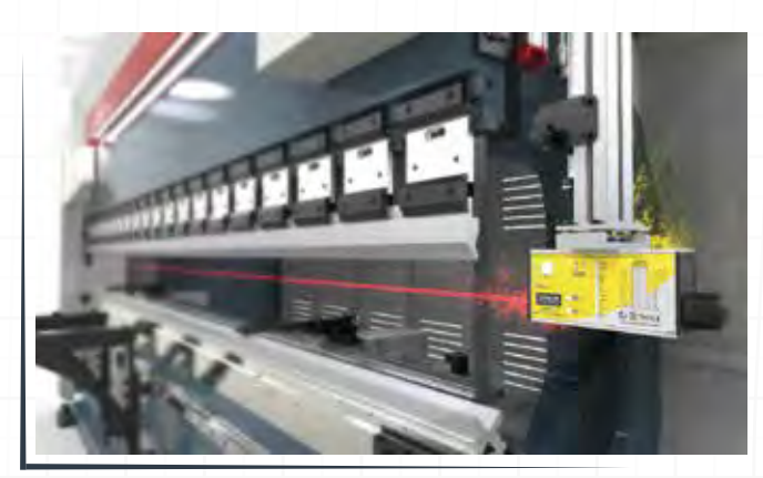
CE Laser Safety System

Our machines are designed in accordance with European CE standards and directives in order to ensure your safety with hydraulic, electric, appropriate height covers and laser light curtains. CE safety in tandem machines is provided with light barriers.