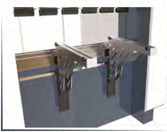
Front Sheet Support System with Linear Guide and Aluminum Miter

The strong front arm can be moved to the right and left and fixed at the desired position with a linear slide and roller system. With aluminum miter and bar support, the sheet material can be easily moved to the machine.