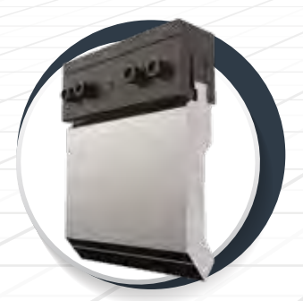
DURMA Top Tool Holder