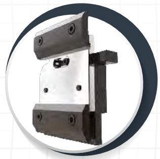
European Clamping System

DURMA is your solution partner with various tool options.