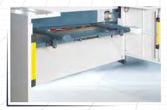
Curtain Light Guards