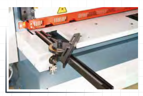
Adjustable Angle Stop 0-180° Finger Guard Ball Transfer Table Hold Downs with Rubber

Backlash-free operation high torques at operating cycles Maintanence free