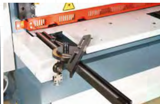
Adjustable Angle Stop 0-180° Finger Guard Ball Transfer Table Hold Downs with Rubber

Backlash-free operation high torques at operating cycles Maintenance free