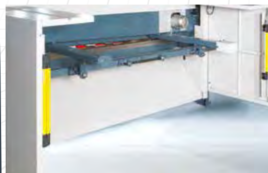
Curtain Light Guards